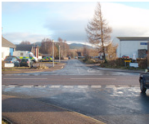
Fig. 2: Vehicle access on Muirton