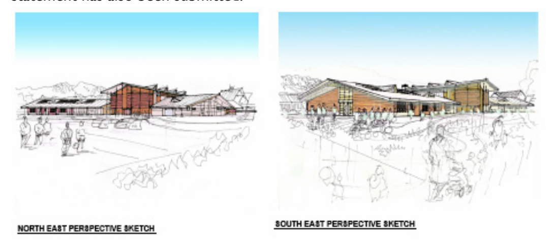
Fig. 9: Perspectives

12. A Development Impact Assessment showing that SUDS can be accommodated on site accompanies the application. Along with this, an outline Green Travel Plan and 'Safer Routes to School' programme have been made available. A design statement has also been submitted.