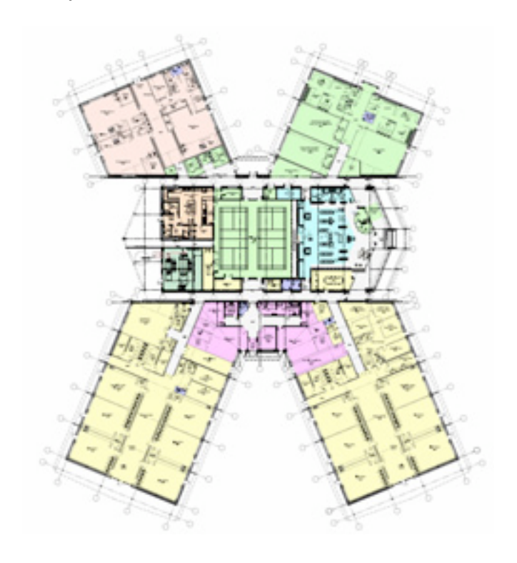
Fig. 8 Floor plan (An A3 sized floor plan is available at Appendix 2)

11. The community school building is designed to be highly sustainable, currently at BREEAM rating 'Very Good' (albeit the assessment process is currently ongoing, the applicant still aims to achieve an 'Excellent' rating). The building would be highly insulated, energy efficient and 100% heated by a biomass wood pellet boiler. A sustainability statement confirms that the timber linings, stone and other materials would be sourced locally, as would the wood fuel for the boiler.