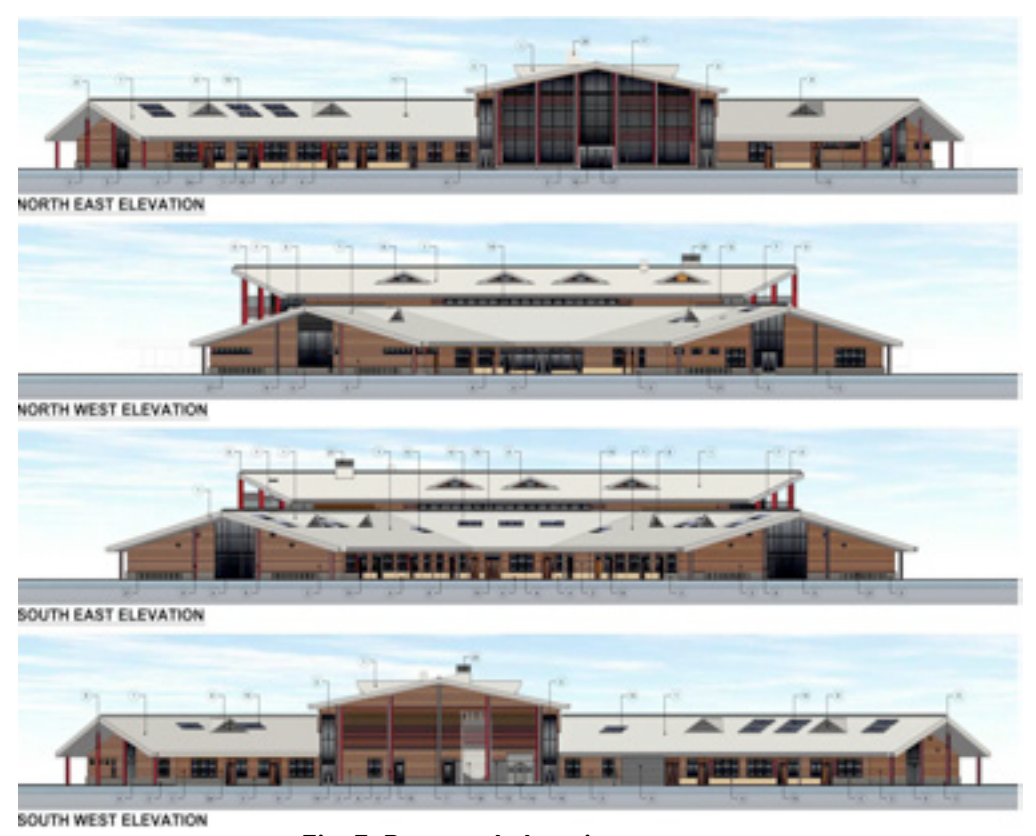
Fig. 7: Proposed elevations

9. A contemporary design is proposed for the community primary school, formed with 4 wings projecting around a main core area. The building proposed is single storey, simple in form and modern in appearance. It would express its function as a primary school and community hub, with a design and materials which reflects the surrounding site and its woodland setting in particular. A sensitive palette of materials is proposed; including natural stone walls, timber cladding; coupled with a zinc panelled pitch roof with overhanging eaves. The building would be approximately 110m in length (north to south) x 90m wide (east to west) and would be 12.6m in height overall.