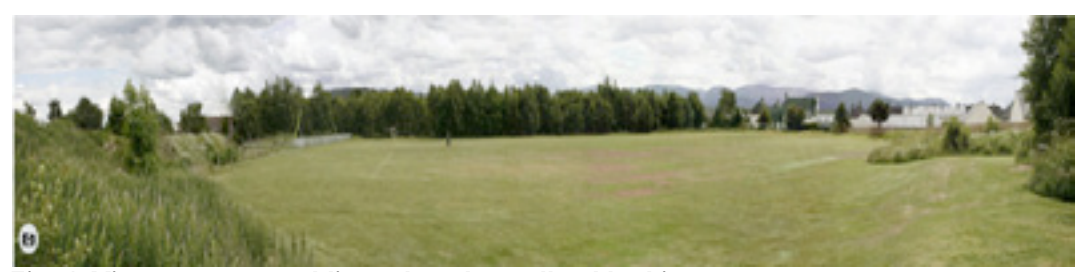
Fig. 4: View across to public park and woodland looking east