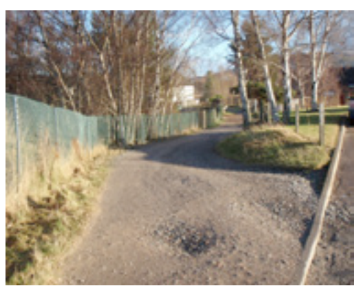
Fig. 3: Existing gravel track