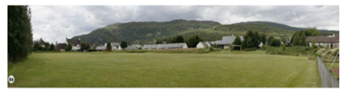
Fig. 5: View across to football pitch looking west